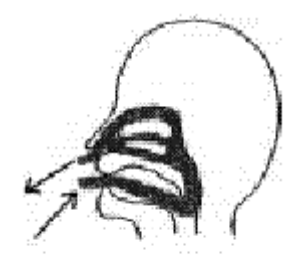
Water Flow - Stage 3

In the more advanced of Stages 2 and 3, only attempted after mastery of Stage 1, the water flows fully through the whole nasal cavity, down the back of the nasopharynx and comes out through the mouth. In this route, it passes by the post nasal sinuses, cleansing all the nasal passages more strongly. In neither version is there any discomfort or damage to the nasal functions.